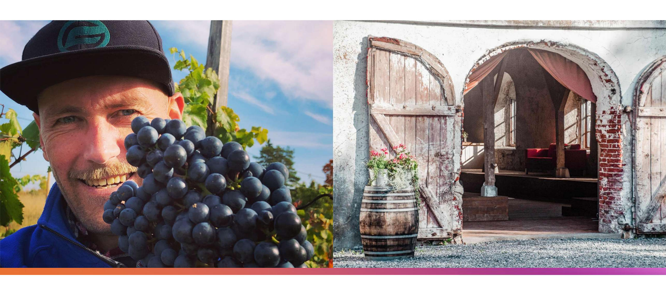
Muhu and Valgeranna